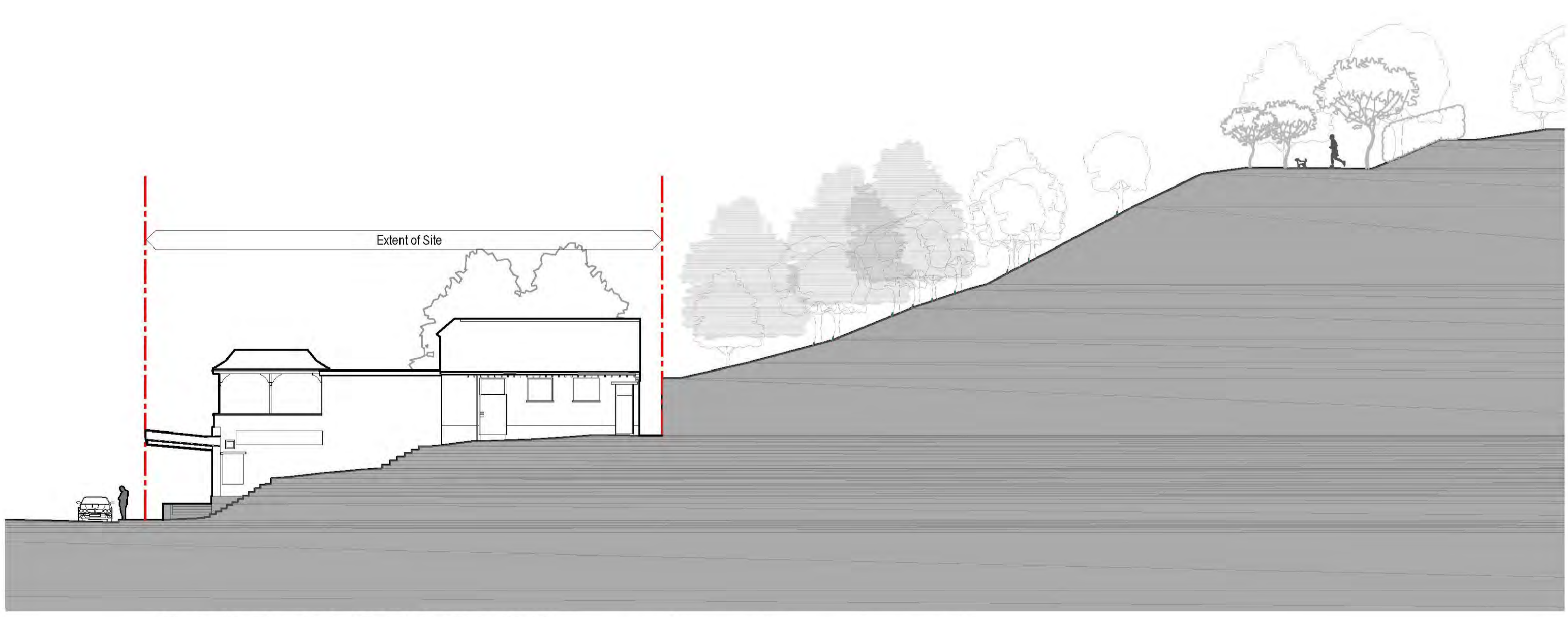
EAST ELEVATION Scale 1:200