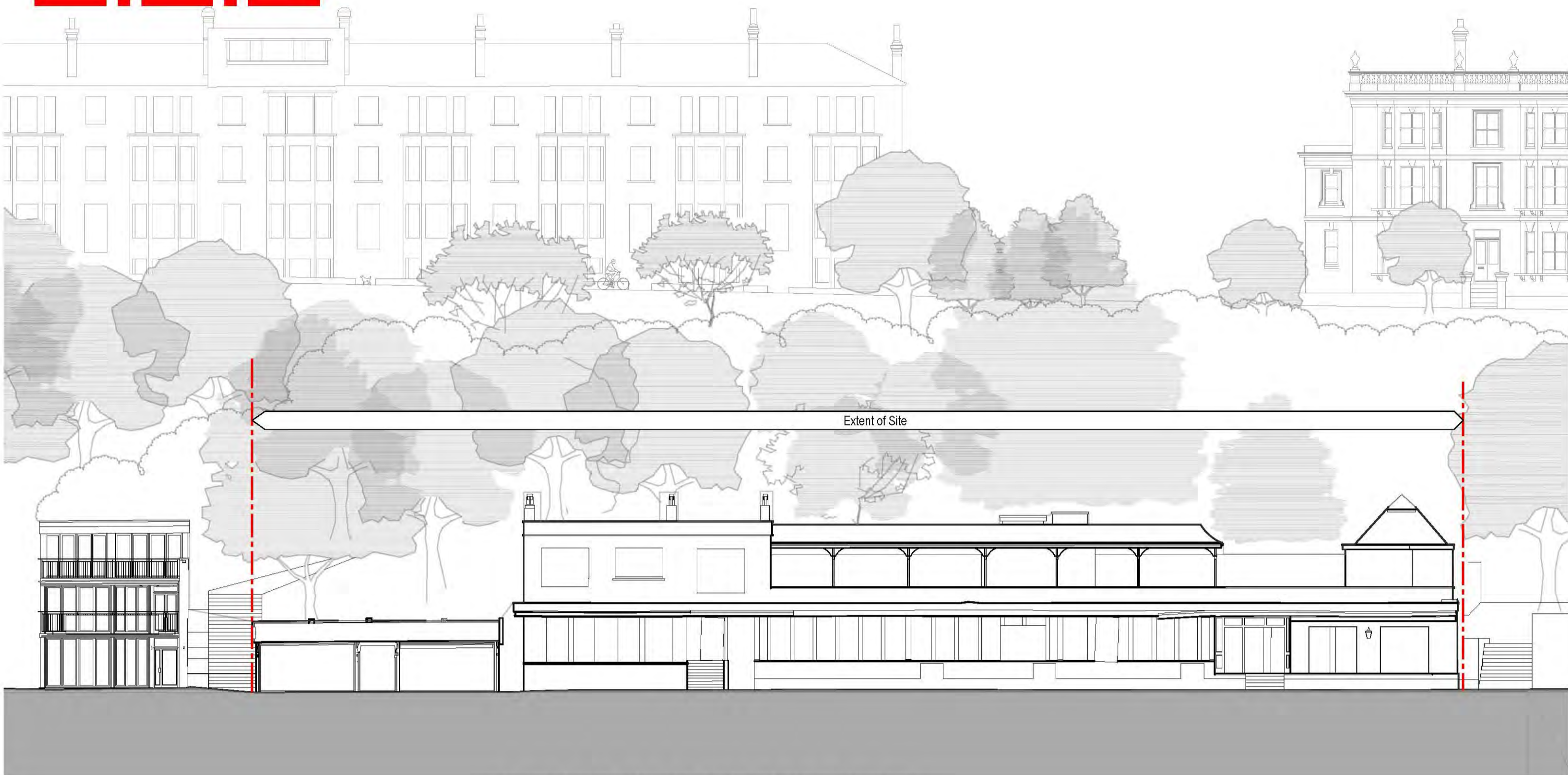
SOUTH ELEVATION Scale 1:200