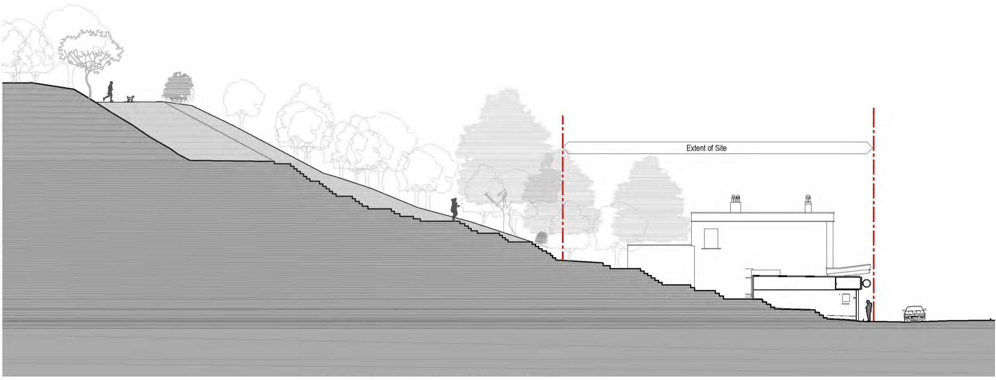
WEST ELEVATION Scale 1:200